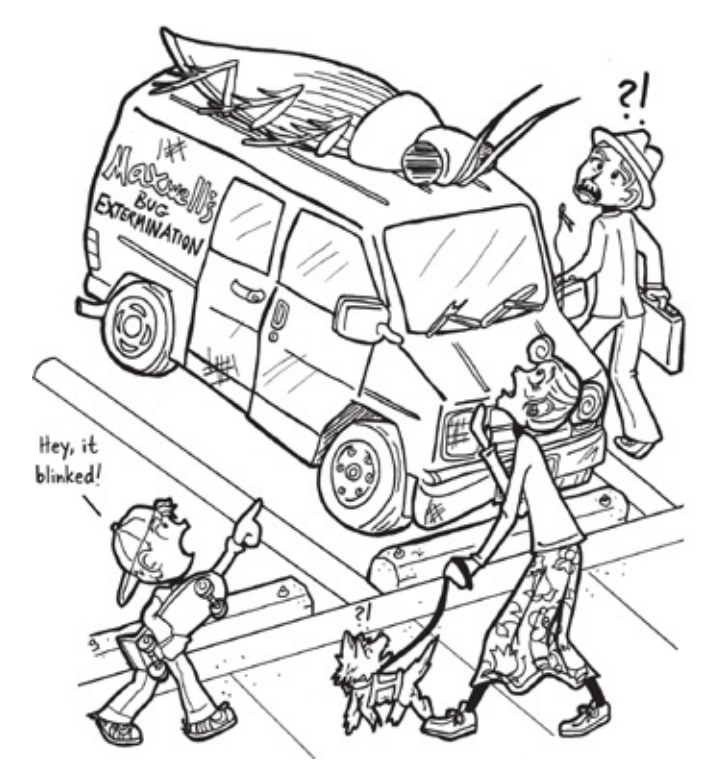
Not only is it hideous-looking, but it makes you feel really ... ODD.

People stop right in their tracks and stare at it in awe.